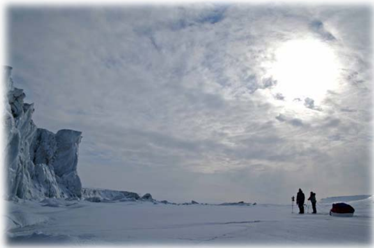
Svalbard - Ice Warrior Expedition 2007

The Ice Warrior Svalbard Hiking trip starts with an early morning wake-up call and breakfast at your accommodation in Longyearbyen where we will have spent our first night meeting our fellow hikers and preparing for the off.