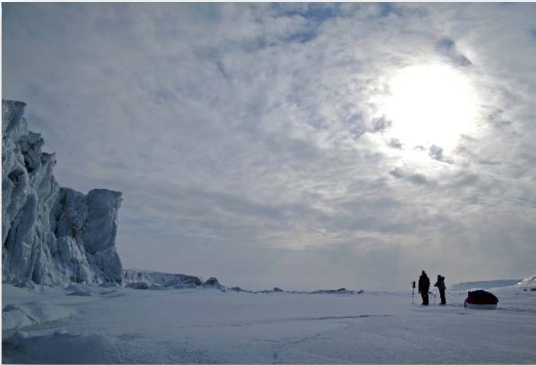
Svalbard - Ice Warrior Expedition 2007

The Ice Warrior Svalbard Hiking trip starts with an early morning wake-up call and breakfast at your accommodation in Longyearbyen where we will have spent our first night meeting our fellow hikers and preparing for the off.